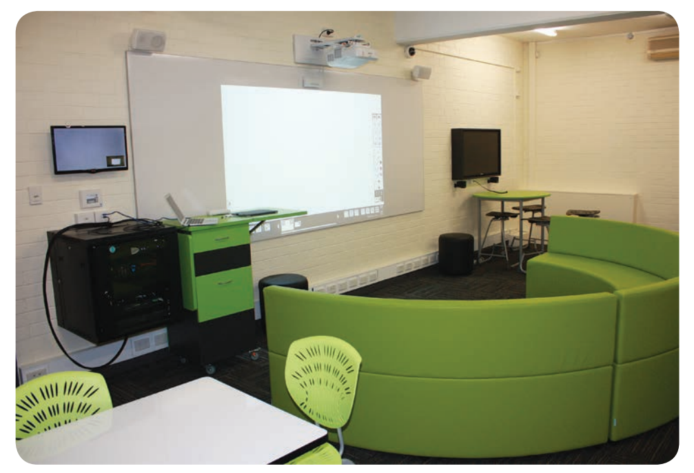
Ivanhoe Grammar - The Learning Well "Campfire Area"

The great thing about The Learning Well was the inclusion of several breakout stations, called Pods. These learning Pods incorporated the Philips BDL4220QL 42" LED TV and JED T460 control panel to create simple, easy-touse learning areas for students to work in smaller groups. They included the integration of multiple 3.5mm audioout ports to explore the use of student headphones when doing group audio work. HDMI-only input wall plates were