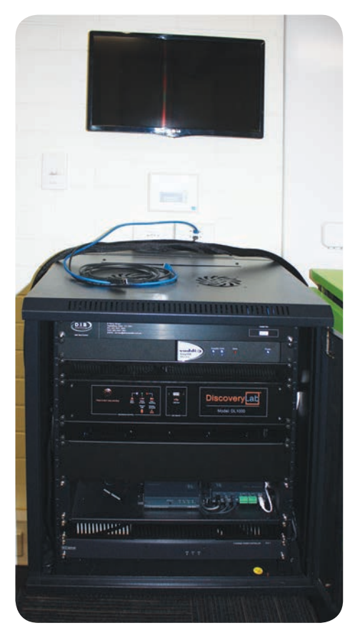
DiscoveryLab<sup>™</sup> system - enhancing teacher professional development

device/laptop, with an inset picture of the front of the room. This is very effective for recording flip learning content.