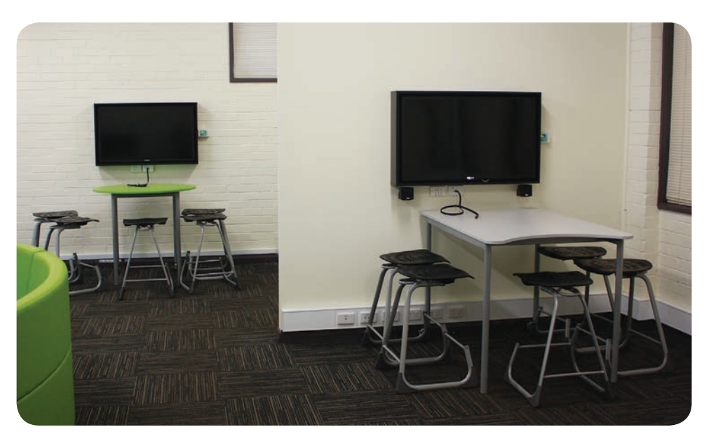
Two Watering Holes - informal spaces for students to share, learn & teach

installed at each of the learning stations for input to the Philips LED TVs.