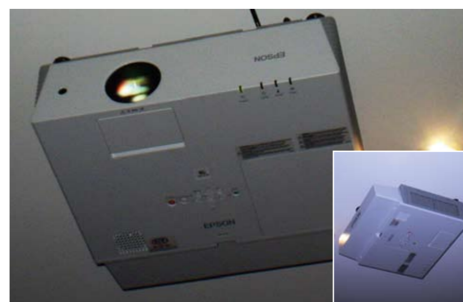
LEFT: One of the many plasma tv screens installed within the new bar ABOVE: The EPSON EMP-6100 with its unique electrostatic filter is built to withstand the rigours of incredibly dusty & smoky environments MAIN IMAGE: Their new members bar was upgraded to include a giant screen projector system