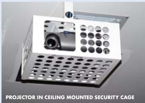
PROJECTOR IN CEILING MOUNTED SECURITY CAGE