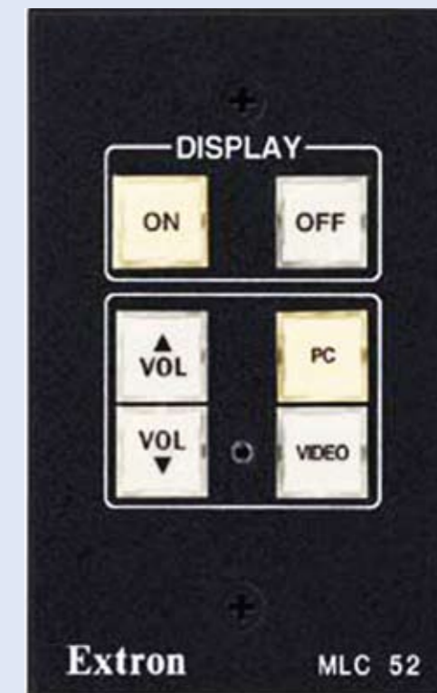
ABOVE: MLC-52 - Front Panel with buttons lit

Introducing the Extron MLC 52 – a classroom control system with click button and illumination. With the MLC 52 there are no misplaced remotes to search for, no confusing menus to navigate, and no dead batteries! Instead it offers a central point of control for a display device's key functions, providing user-friendly control for power, volume and input selection – making operations much more efficient.