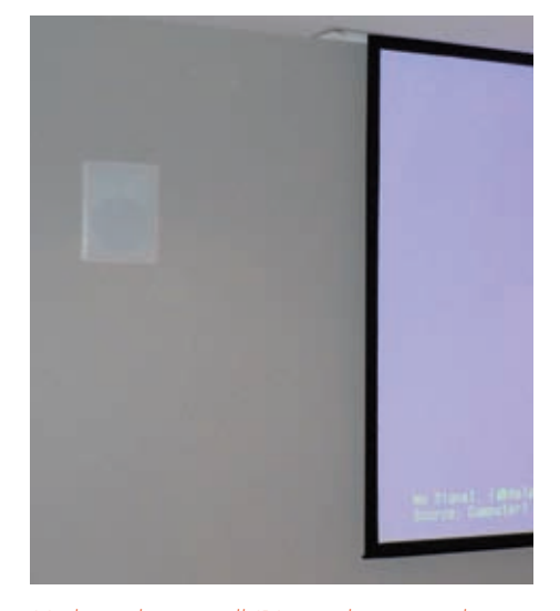
High quality in-wall JBL speakers provide discreet yet powerful sound

CUSTOMISED INSTALLATION AT KOROWA NEW INTERACTIVE WHITEBOARD MIMIO SOFTWARE AUSTRALIAN OPEN 2006 SERVES UP A SUCCESS INTEGRATED CONTROL SYSTEM TAKES XAVIER AHEAD