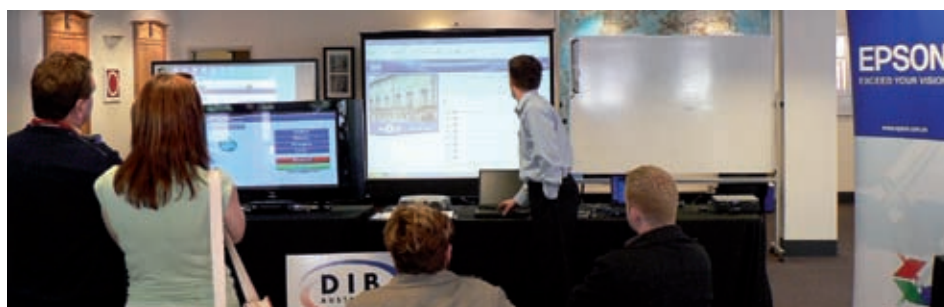
Attendees getting a taste of the latest in smart classroom technologies

DIB chose a lovely autumn day to hold their first "Smart Classroom Exhibition" in the leafy surrounds of Ivanhoe Grammar School. Being a school that enables its student's access to a vast range of rich technology resources, Ivanhoe Grammar was the perfect host venue and many thanks go out to the staff who were gracious in their assistance on the day.